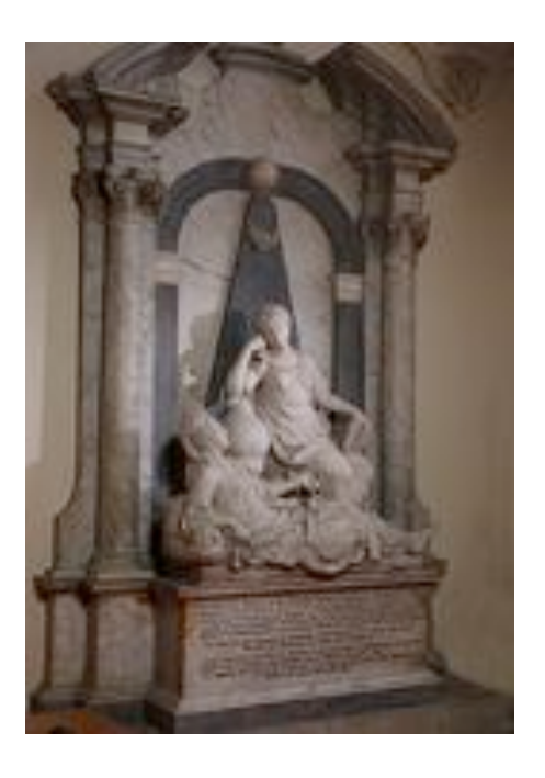
St Mary's church is home to the magnificent tomb of Mrs Thomas, which Harris, in Three Men in a Boat, was very anxious to see

However many buildings still remain - the old Wesleyan chapel is now being refurbished having spent part of its life as an "Electric Blanket Repair Centre". The very attractive balconied building next to the Church Hall, 1 Church Street, only dates back to the 1920s. Next to it is the oldest building in Hampton, the Feathers, built about 1540. This building became a pub in the early 16th century and remained an inn until about 1792. It was then divided into four tenements, one of which was occupied by the village blacksmith until about 1920. The building is regrettably swamped by the traffic on the A308 and A311 roads. Slightly to the east is Garrick's Villa, where the famous actor of the late 18th century lived and across the A308 is Garrick's Temple on the riverside, which was built in 1756 to celebrate the genius of William Shakespeare.