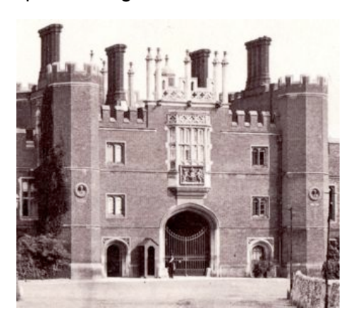
Hussar Guarding the Gate (circa 1880)

lan showed us photographs, which informed us of changes to the bridge, the moat, the paths, the Queen's Drawing room, the mini turrets, the chapel pews, the gates and the windows.